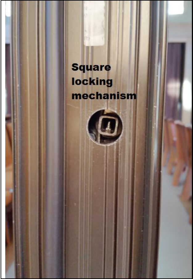
Square locking mechanism